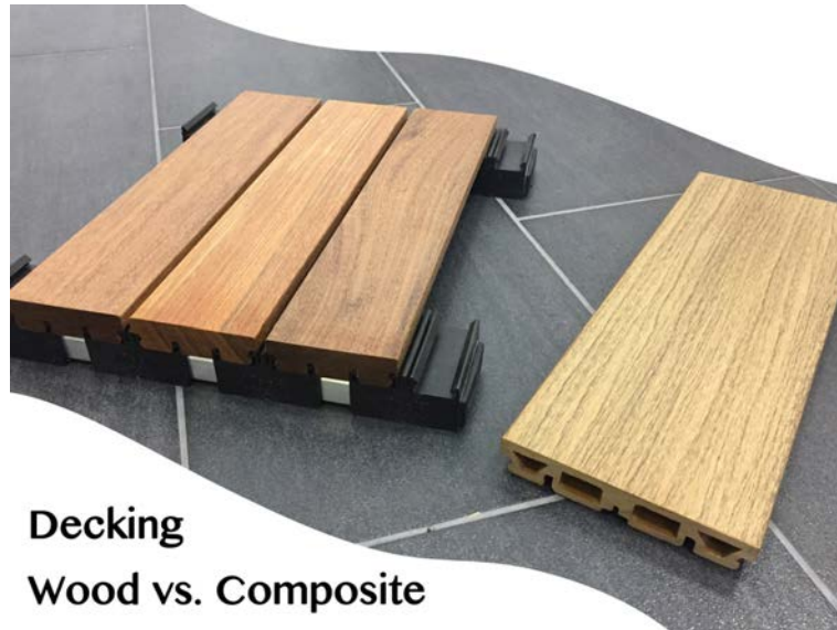
Decking Wood vs. Composite

Choosing the right material for your deck is a process that needs knowledge. If we're opting for a wooden deck, first consideration is to go for a noble wood like IPE or Teak for example.